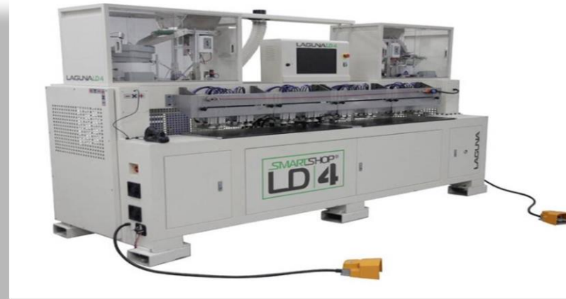
Precision CNC Machine