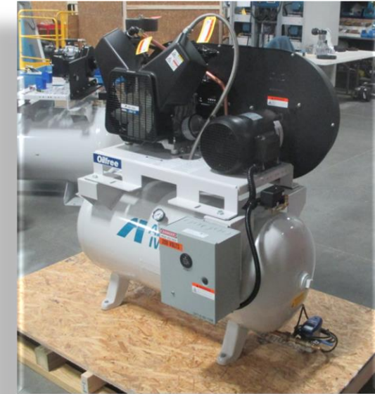
Model OFT-5-60-T460 List Price $8,340

DETAILS: Instrument Air for precision valves. Compressed air from the oil flooded plant air system will foul precision valves and instrumentation almost immediately. Clean, Oil Free, High Quality air is required for use with precision instrumentation. The customer chose the Anest Iwata OFT-5-60-T460 because of the Long Life, ease of maintenance, cooler operating temps, low noise and vibration, compact design and quality of air. The machine is installed at “Point of Use” requiring very little piping.