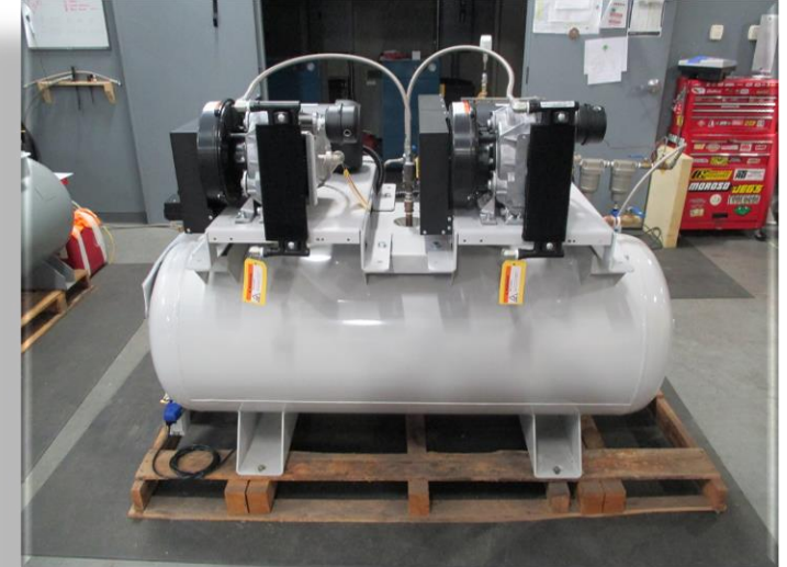
Model SLT-15D-120-T460 List Price $25,280

DETAILS: The customer purchased two new packaging lines and determined the cost to expand the capacity of their existing Oil Free plant air system to be more than 6 times the cost of the AIAE Point of Use system. The SLT-15D-120 provides High Quality Oil Free air in a quiet compact design to two new packaging lines. The Point of Use installation allowed the customer to locate the new lines in a optimum location in the plant to maximize their process efficiency.