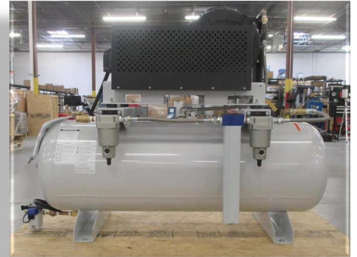
SLT-7.5-80-FM-T460 List Price $17,370

SPECIFICATIONS: _____ HORSEPOWER: 7.5 HP OPERATING PRESSURE: 85-115 PSI AIR DELIVERY: 19.8 CFM CONTROL SYSTEM: MULTI UNIT CONTROL - AUTO STOP/START NOISE LEVEL: 74 dBa AIR OUTLET: BALL VALVE 3/4" NPT POWER: 208-230-460V/3 PHASE/60Hz DIMENSIONS: 26" x 38" x 62" WEIGHT: 565 LBS.